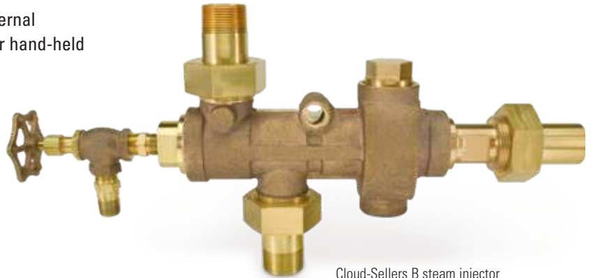
Cloud-Sellers B steam injector for liquid discharge capacities up to 34 gpm (129 lpm)