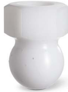
TankJet VSM tank cleaning nozzle

For lances, mounting kits, adapters and more, see page G6