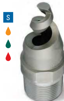
BSJ – 1/4" to 4" male conn. Threaded/Round or flat body style/stainless steel

Custom sizes and other abrasion-resistant materials available. See Quick Reference Guide.