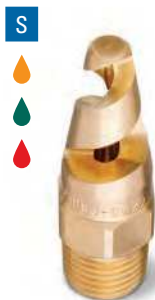
BSJ – 1/4" to 2" male conn. Threaded/Hex. body style/brass