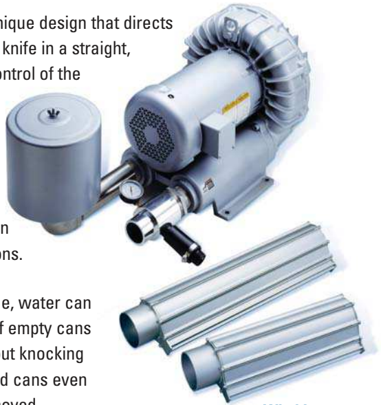
WindJet Air Knives

WindJet Air Knives are also lightweight and easy to maneuver. The blowers are energy-efficient, significantly lowering operating costs in comparison to compressed air.