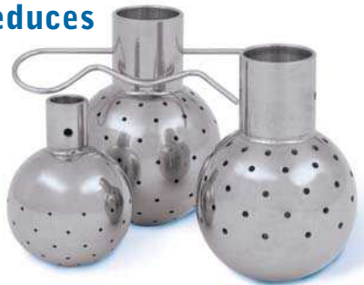
63225 Fixed Spray Balls

Designed to increase cleaning impact up to four times greater than conventional rotating nozzles, the 63225 Spray Balls are excellent for cleaning, sanitizing and foaming applications in both containers and equipment.