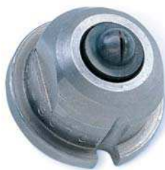
Can Coating Tip

Our new Can Coating Tip sprays a patented distribution pattern that gives superior strand weights from the top to the bottom of the can but uses less coating material than competitive nozzles. With coating being the second largest operating expense following aluminum, this simple change in nozzle design can make a significant impact on your bottom line. Cuts in the orifice create an asymmetrical spray distribution that is calibrated to the shape of a 2-piece, 12 oz. or 16 oz., 2.4 inch (61 mm) diameter beverage can. Coating is applied exactly where it is needed significantly reducing can weights.