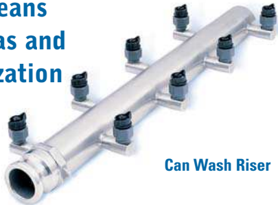
Can Wash Riser

Narrow angle nozzles and optimal nozzle spacing allow the spray to effectively penetrate the conveyor mat without knocking over the cans. This style of riser can also be designed to work with hollow cone nozzles in a pasteurization process to ensure a uniform distribution of liquid over the entire conveyor width.