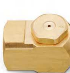
AX 1/8" to 3/4" female conn. Slope-bottom design Removable cap