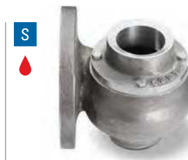
CF 4" to 6" flange conn. Two-piece cast-type