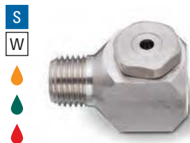
BX – 1/8" to 3/4" male conn. Slope-bottom design Removable cap