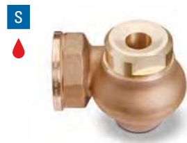
CRC 1-1/4" to 4" female conn. Two-piece cast-type