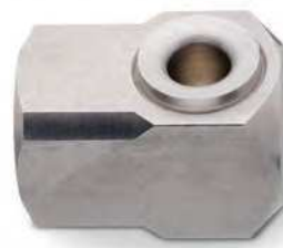
E One-piece bar stock 1/4" to 3/8" female conn.