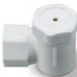
AP 1/4" to 3/8" female conn.