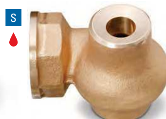
CX 1" to 2-1/2" female conn. Slope-bottom design One-piece cast-type