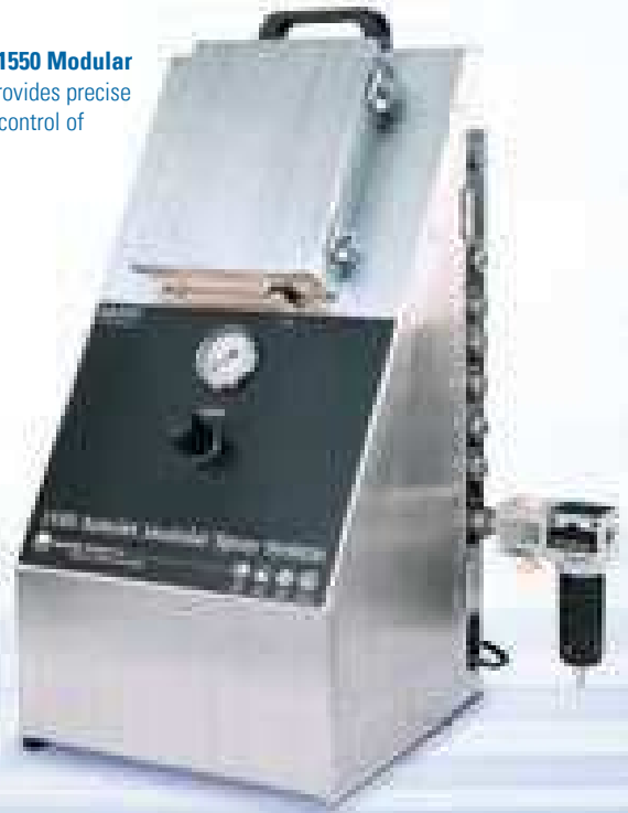
AutoJet Model 1550 Modular Spray System provides precise on/off automatic control of nozzles.