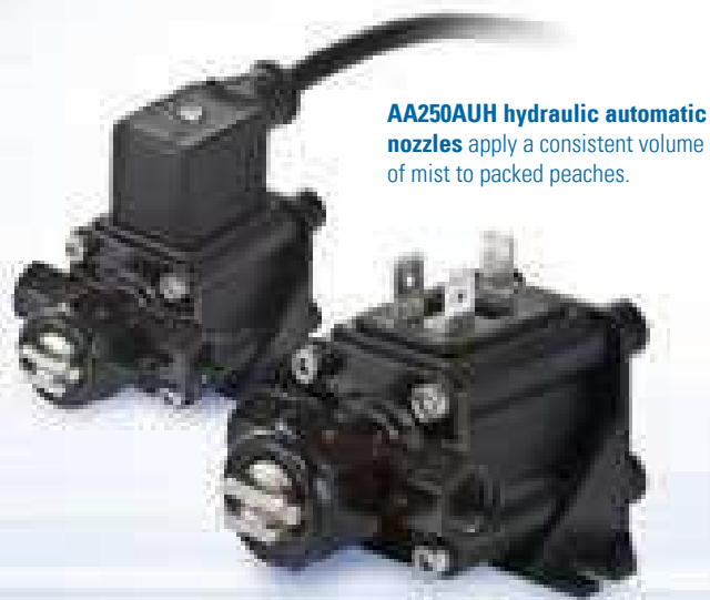
AA250AUH hydraulic automatic nozzles apply a consistent volume of mist to packed peaches.