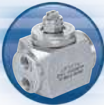
Eight AA10000AUH-72400 heated Pulsajet® nozzles apply the slack wax to the wood chips.