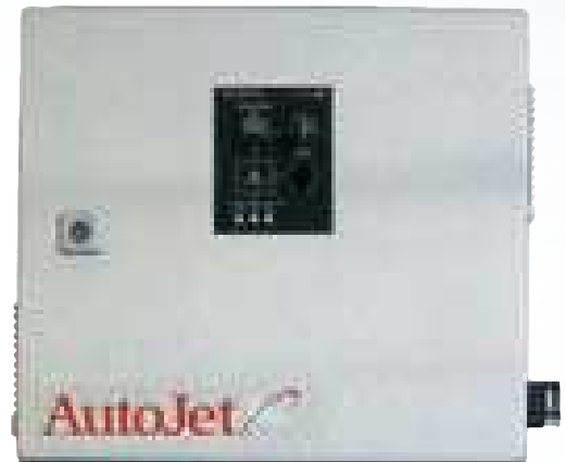
AutoJet Model 2008 Spray Control Panel provides easy control of nozzles and cycle times up to 16,000 cycles per minute.