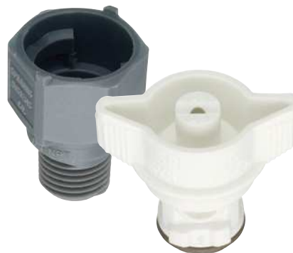
ProMax Quick VeeJet®

QuickJet spray nozzles require a quick 1/4-turn of the wrist to remove spray tips. No tools are required. These quick-change nozzles are ideal for areas where maintenance is conducted frequently.