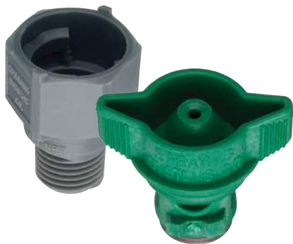
ProMax Quick FullJet®