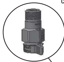
ProMax QuickJet Nozzles

A third-party review validated that chill time had decreased, and water consumption and ice build-up on the rails and refrigeration equipment was significantly reduced. It was also verified that carcass weight loss was minimal during the cooling process.