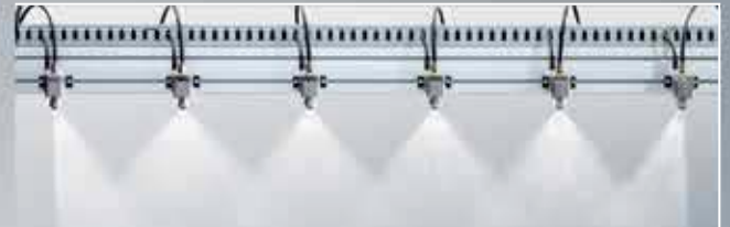
PULSAJET® SPRAY HEADER

PulsaJet headers, used in both the PanelSpray-RA and PanelSpray-MS systems, are fabricated to meet press specifications. Header length, placement and nozzle placement on the header are customized to ensure accurate distribution across mats, belts or cauls of any width.