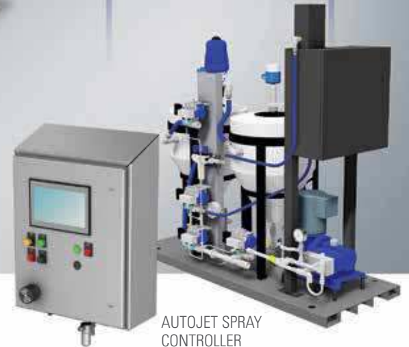
AUTOJET SPRAY CONTROLLER WITH TOUCH SCREEN HMI

The PanelSpray-NM system, controlled by an AutoJet® spray controller with convenient touch screen HMI, is easily integrated with existing plant equipment. Marking ink is fed from a tote into a concentrate tank, diluted to the specified concentration and stored in a day tank. The ink is pumped to automatic spray nozzles equipped with clean-out needles to ensure clog-free performance. Nozzles are arranged in headers to produce any nail line pattern required by your customers. Single or double pass marking patterns are possible. Ink is recirculated from the spray nozzles to the day tank continuously to maintain a consistent mixture and keep solids in suspension.