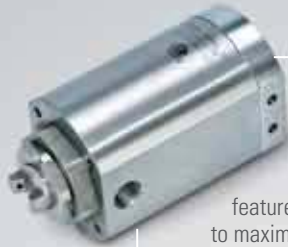
AIR ATOMIZING PULSAJET® NOZZLES FOR PANELSPRAY-RS

The nozzles produce very small drops and feature a wide turndown ratio to maximize operating flexibility.