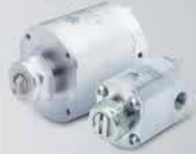
PULSAJET HYDRAULIC NOZZLES

PulsaJet headers, used in both the PanelSpray-RA and PanelSpray-MS systems, are fabricated to meet press specifications. Header length, placement and nozzle placement on the header are customized to ensure accurate distribution across mats, belts or cauls of any width.