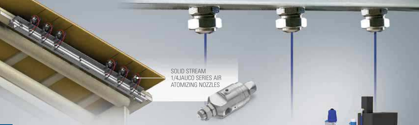
SOLID STREAM 1/4JAUCO SERIES AIR ATOMIZING NOZZLES