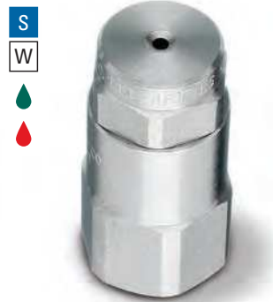
G 1/8" to 1/2" female conn. Removable cap and vane