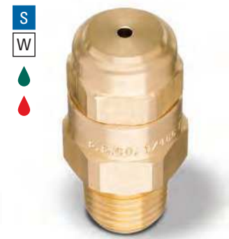
GG 1/8" to 1/2" male conn. Removable cap and vane