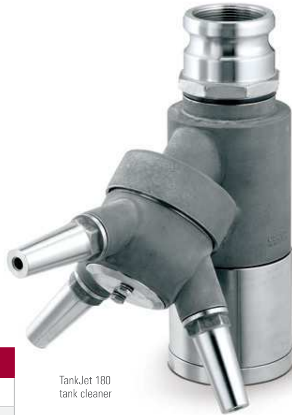
TankJet 180 tank cleaner