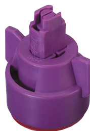
AIXR TIP AND CAP