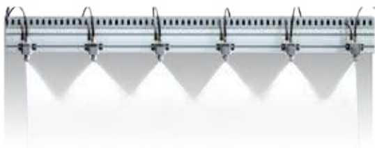
The 98250 spray manifold , which features a compact design with rigid aluminum structure, can be configured with flexible lengths, number of nozzles and nozzle spacing