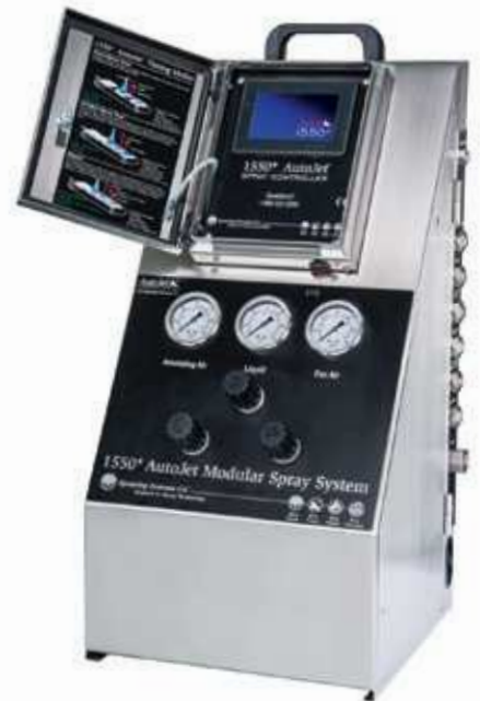
AutoJet Model 1550+ Modular Spray System , which features liquid control for proper flow, ensures accurate placement of coating to minimize waste

For more information about Precision Spray Control, visit spray.com/psc