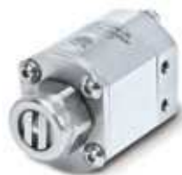
Pulsajet® electrically actuated spray nozzles achieve varying flow rates for a single spray tip, reducing downtime for changeouts, and deliver coating to the target with high efficiency