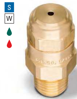
GG 1/8" to 1/2" male conn. Removable cap and vane