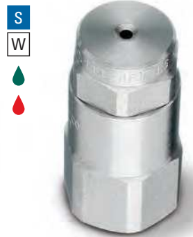
G 1/8" to 1/2" female conn. Removable cap and vane