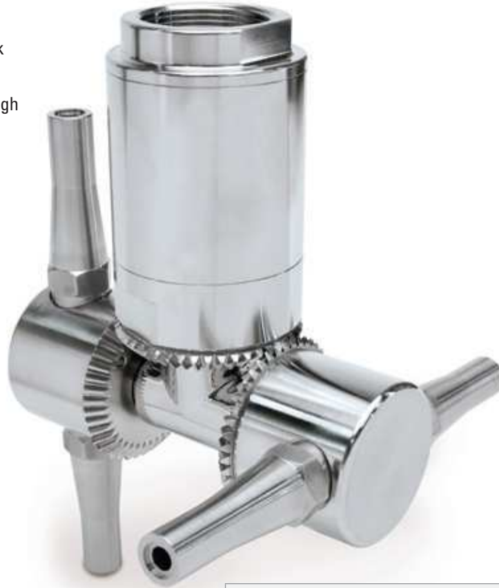
TankJet 65 tank cleaner