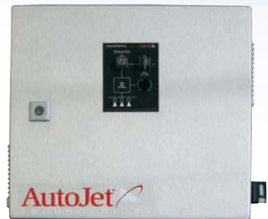
AutoJet Model 2008 Spray Control Panel provides easy control of nozzles and cycle times up to 18,000 cycles per minute.