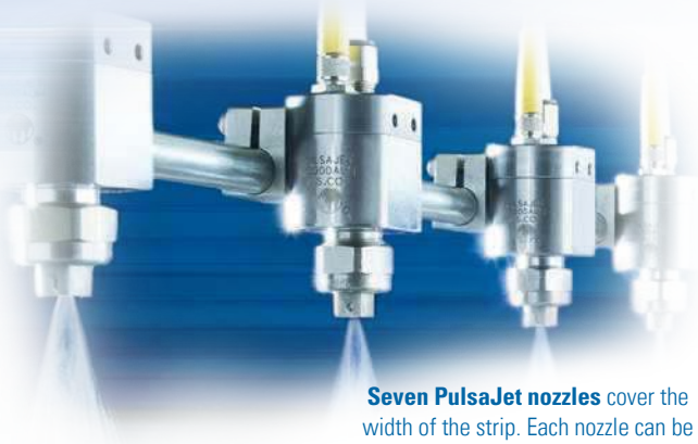
Seven PulsaJet nozzles cover the width of the strip. Each nozzle can be activated individually.