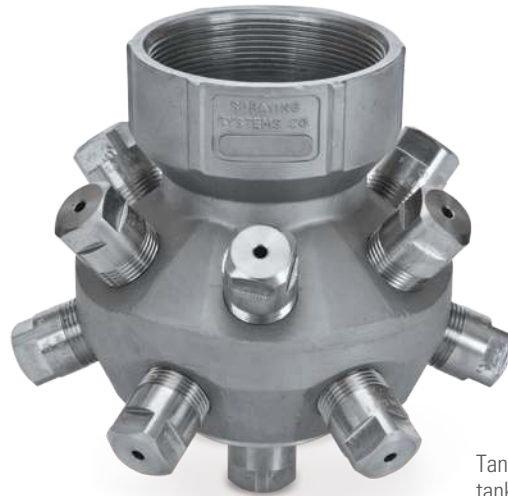
TankJet 12900-1 tank cleaning nozzle