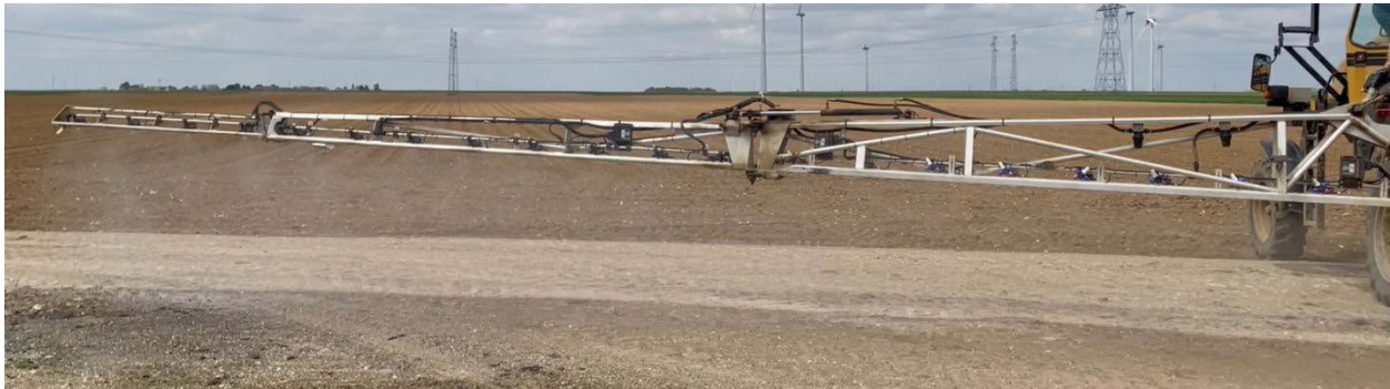
DynaJet® Valve rinsing.

It is important to have clean water going through the DynaJet® valve to evacuate any remaining chemical or debris from the valves. We recommend spraying clean water through the DynaJet® valves for a minimum of 30 seconds to ensure that the valve is clean. This will ensure the longest lifetime of the valves.