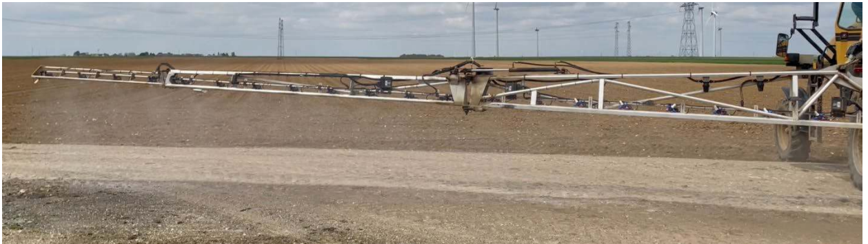
DynaJet® valve rinsing

Before you winterize the sprayer, we recommend washing and rinsing the spray boom as explained in the “Daily maintenance of the DynaJet® valves”.