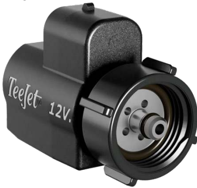
DynaJet® Valve – 115880