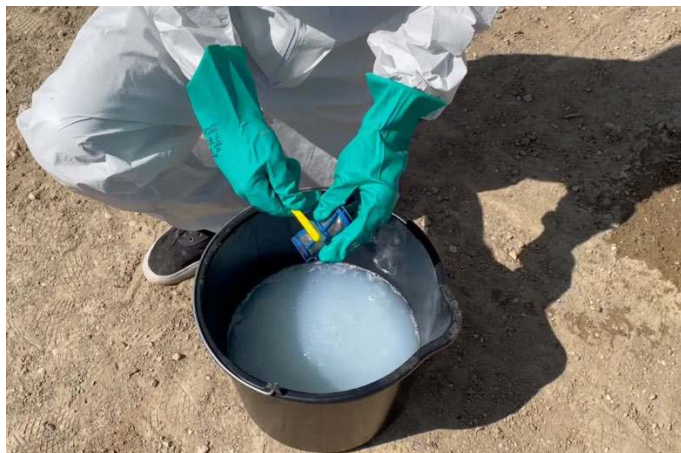
Cleaning of the strainers with a TeeJet Brush

Your spray line strainers will protect the DynaJet® valves from any debris. We recommend you disassemble the strainers every week (when using the sprayer) to check the cleanliness of the strainers. If your strainers are dirty, you should clean them and remove all debris.