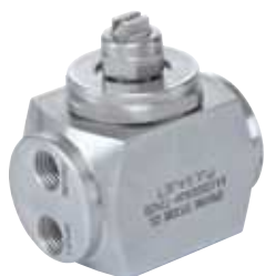
Heated Pulsajet® electrically-actuated air atomizing nozzles apply the wax on the metal sheets prior to stamping.