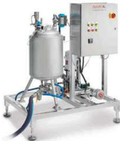
AccuCoat Heated Spray System includes a spray control panel for convenient control of temperature and flow rate. All liquid delivery components are fully jacketed to maintain consistent wax temperature.